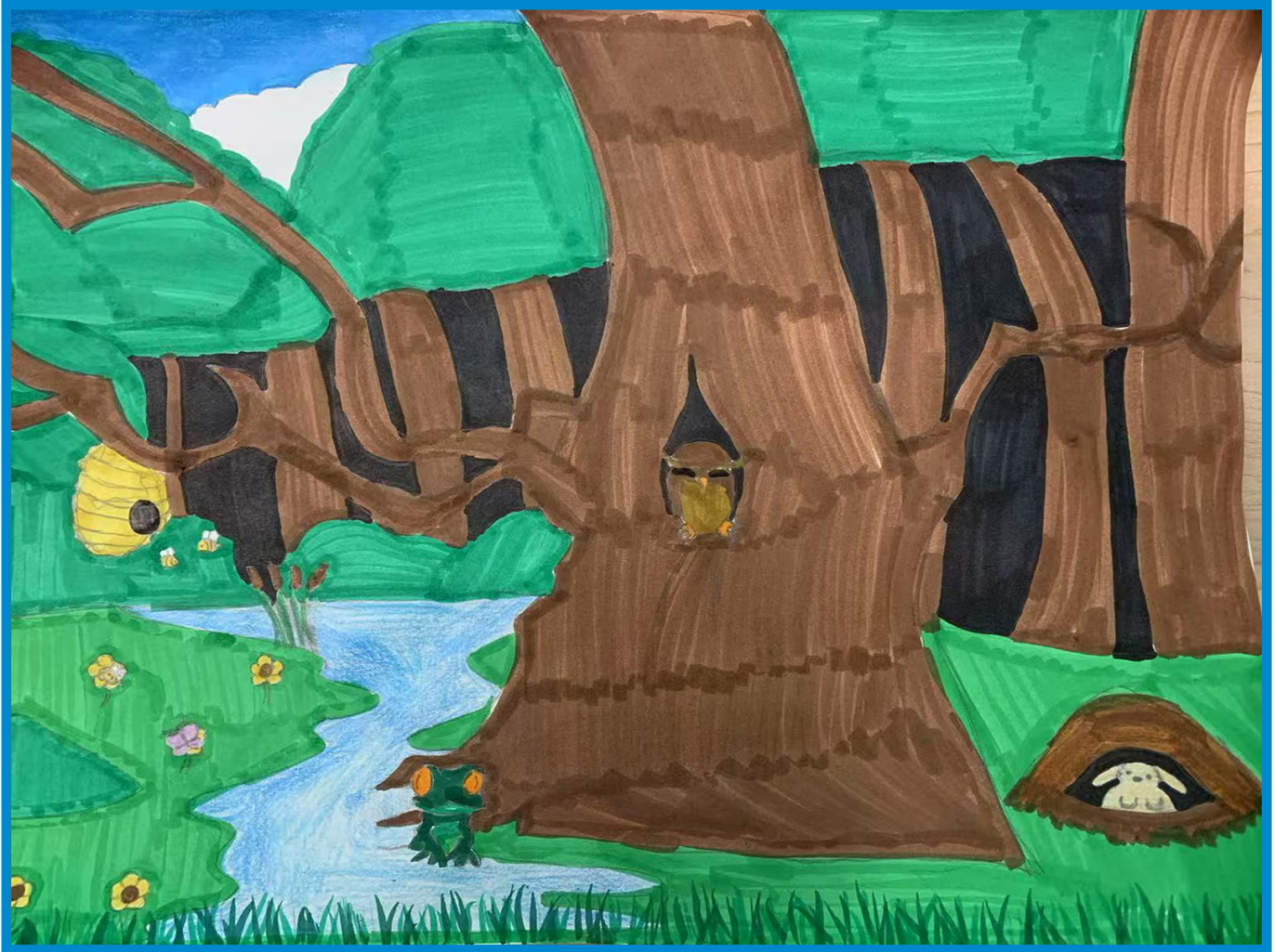
By a Young Artist who lives in St. John's.