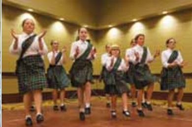
St. Pat's Dancers -Lunchtime Entertainment